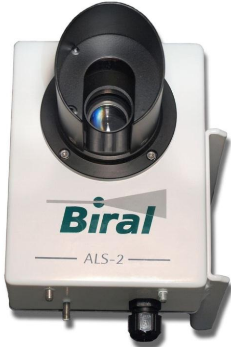
Ambient Light Sensor ALS-2

Biral are pleased to announce the introduction of a New Ambient Light Sensor, our ALS-2