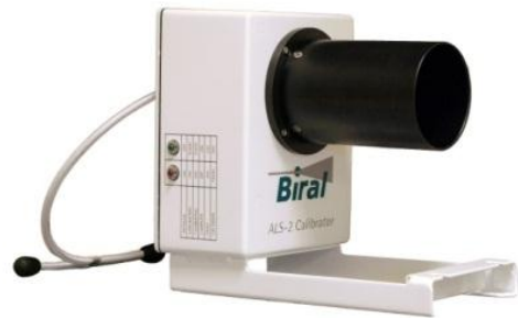
ALS-2 Field Calibrator (optional)