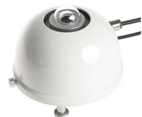
VU01 VENTILATION UNIT Ventilation unit for SR25, SR20, SR20-D1