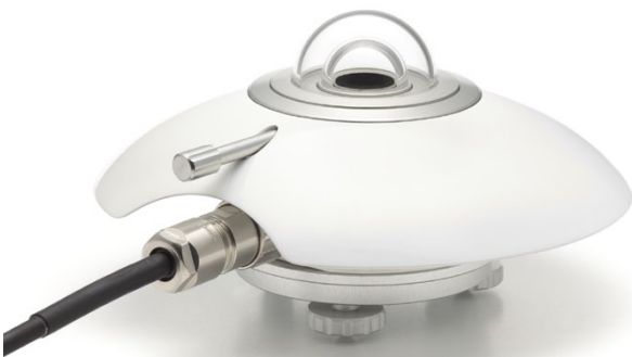
Figure 2 example of a Hukseflux pyranometer: SR25-D1 digital secondary standard pyranometer with sapphire outer dome. This model offers better data availability and measurement accuracy than traditional ventilated pyranometers. Its digital interface, using the industry standard Modbus communication protocol, allows for easy implementation and service