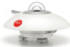
SR25 PYRANOMETER Secondary standard pyranometer with sapphire outer dome

Need for support in your selection process? E-mail us at: info@hukseflux.com