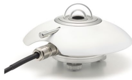
SR20-D1 PYRANOMETER Digital secondary standard pyranometer - Modbus protocol