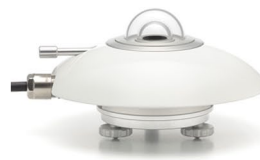
SR20 PYRANOMETER Secondary standard pyranometer