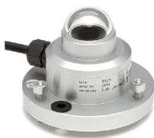
LP02 PYRANOMETER Second class pyranometer