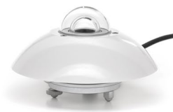
SR12 PYRANOMETER First class pyranometer for solar energy test applications