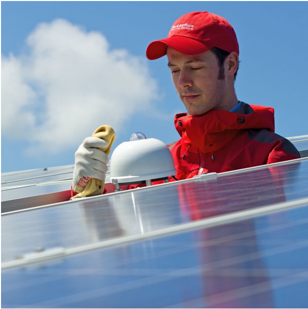
Figure 1 maintenance of SR20 secondary standard pyranometer with VU01 ventilation unit in PV system performance monitoring, measuring plane of array irradiance

Hukseflux offers a wide range of solutions for measurement of solar radiation. This brochure offers you general guidelines for selection of the right instrument. The application of pyranometers in PV system performance monitoring is highlighted as an example. Please contact us for further assistance.