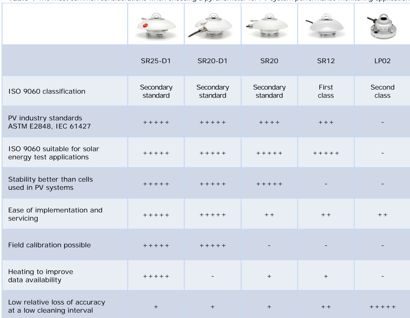
Table 1 The most common considerations when choosing a pyranometer for PV system performance monitoring application

In addition, the digital -D1 sensors are suitable for field calibration by comparison to a reference instrument. Ask Hukseflux for more information on this latest best practice.