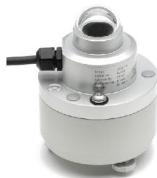
LP02-TR PYRANOMETER Second class pyranometer with 4-20 mA transmitter