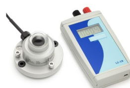
LP02 / LI19 PYRANOMETER Second class pyranometer with LI19 handheld read-out unit